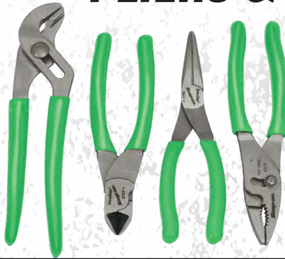
26Q2-PL400BG 4 PC PLIERS/CUTTERS SET (GREEN)