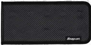
26Q2-MAGMATXL ■ HIGH-POWER MAGNETIC MAT (BLACK)