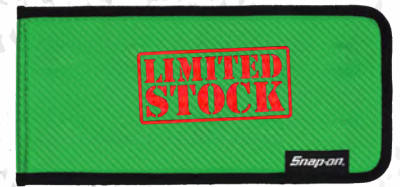
26Q2-MAGMATXLG ■ HIGH-POWER MAGNETIC MAT (GREEN)