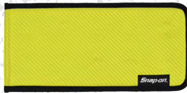
26Q2-MAGMATXLHV ■ HIGH-POWER MAGNETIC MAT (HI-VIS)