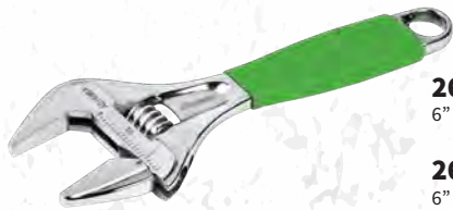
26Q2-ADHW6AG 6" WIDE MOUTH ADJUSTABLE WRENCH (GREEN)