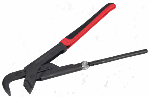
26Q2-PWZ1A 12-5/8" PLIERS WRENCH (RED)