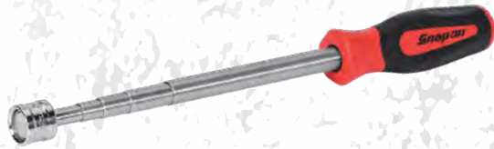
26Q2-PTM18 ■ 18 LB TELESCOPING MAGNETIC PICK-UP TOOL WITH INSTINCT® HANDLE (RED)