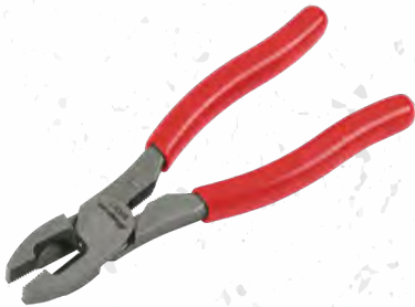
26Q2-59CF 9" HEAVY-DUTY TALON GRIP™ COMBINATION PLIERS (RED)